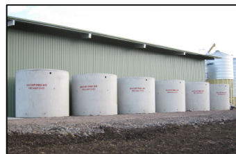
6 x 23,000Lt Heavy duty tanks

We have also manufactured and delivered a number of concrete water tanks out to the Lockyer Valley which is great to see that the area is gradually recovering from the recent disasters (see photos below).