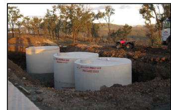
82,000Lt Rainwater harvesting tanks